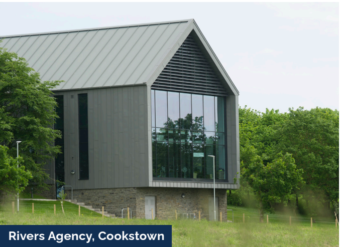
Rivers Agency, Cookstown