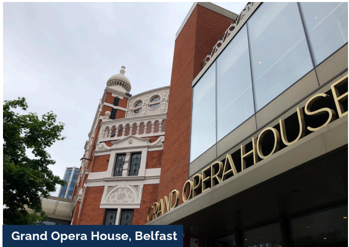
Grand Opera House, Belfast