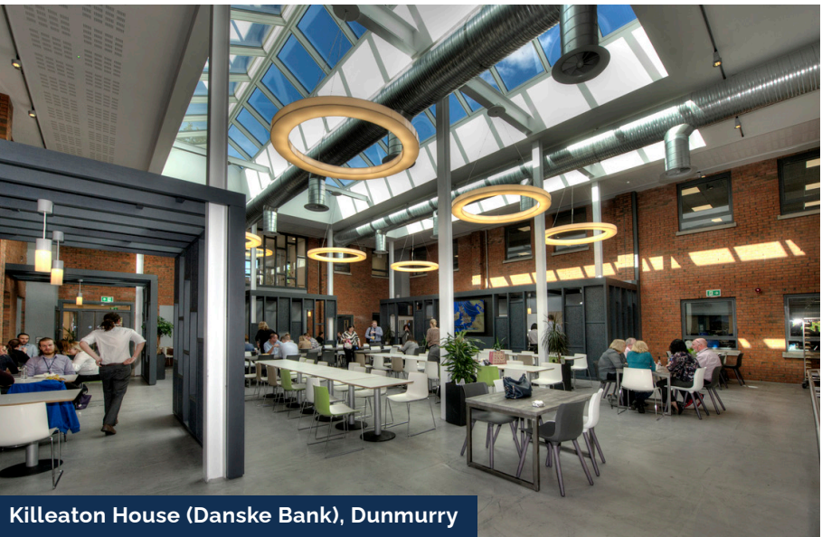
Killeaton House (Danske Bank), Dunmurry