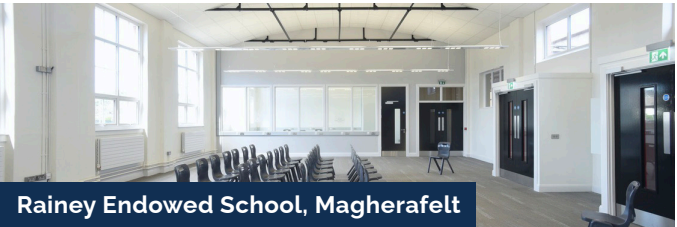
Rainey Endowed School, Magherafelt