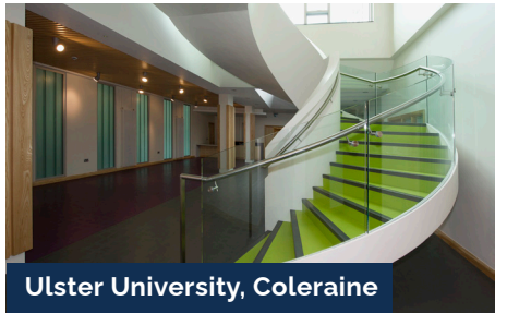
Ulster University, Coleraine