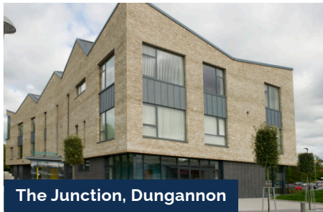
The Junction, Dungannon