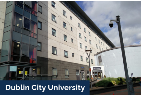
Dublin City University