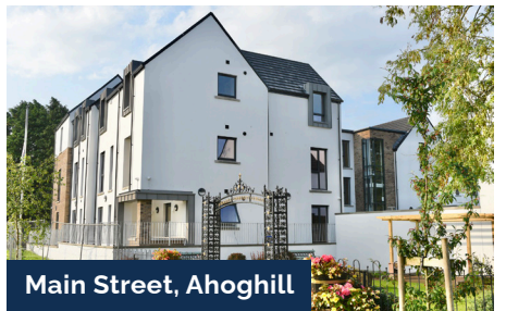
Main Street, Ahoghill