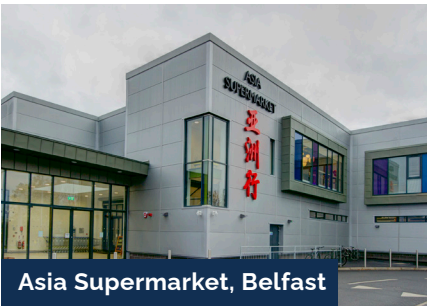
Asia Supermarket, Belfast