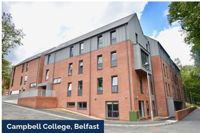
Campbell College, Belfast